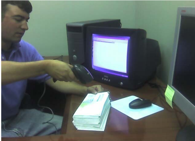
On-Site Scanning Process